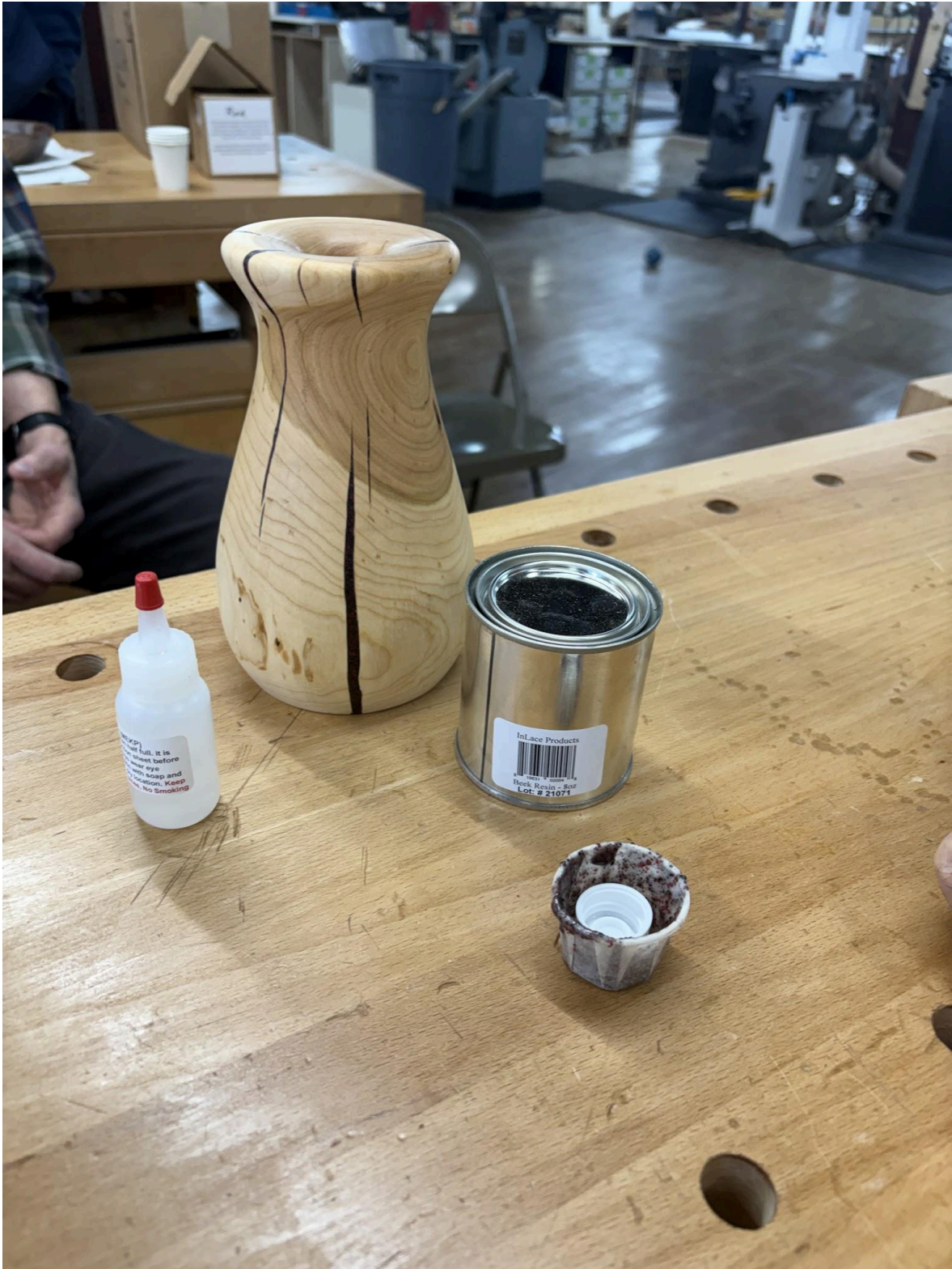
Ed - Cherry with Crack Filler