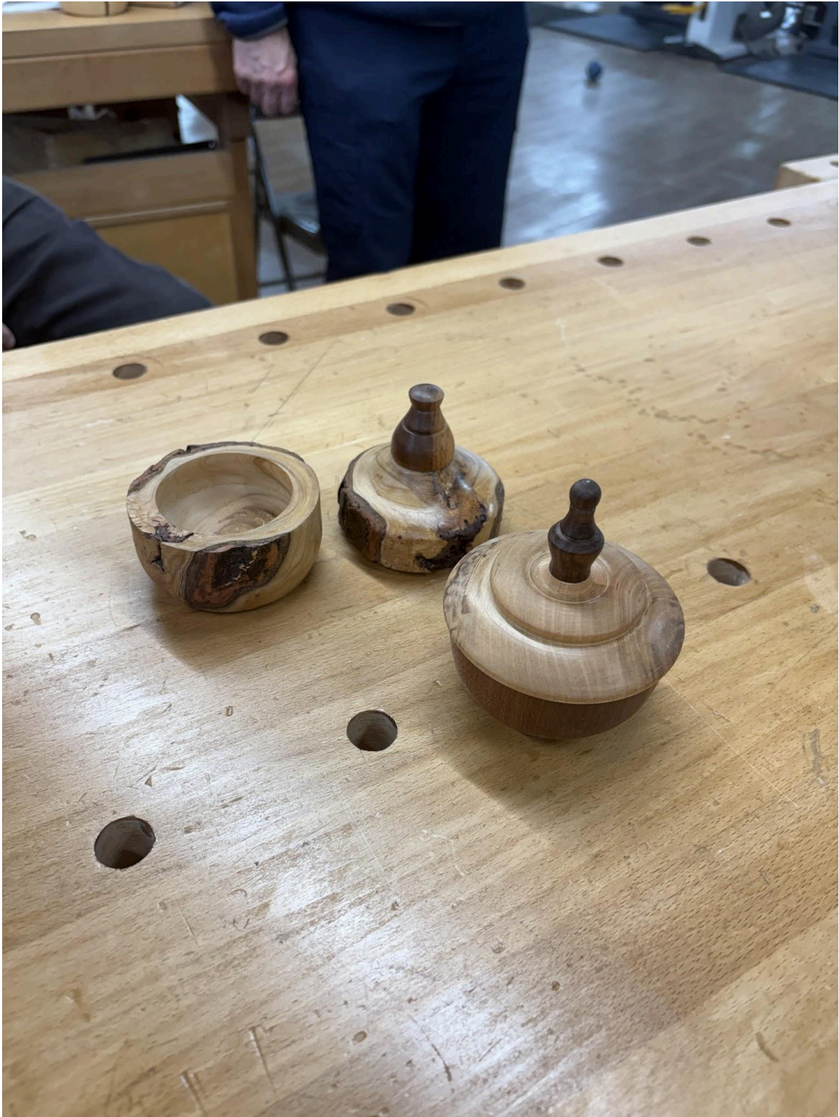
Jack - Cherry bark vessel with walnut top Walnut vessel with maple top & walnut handle