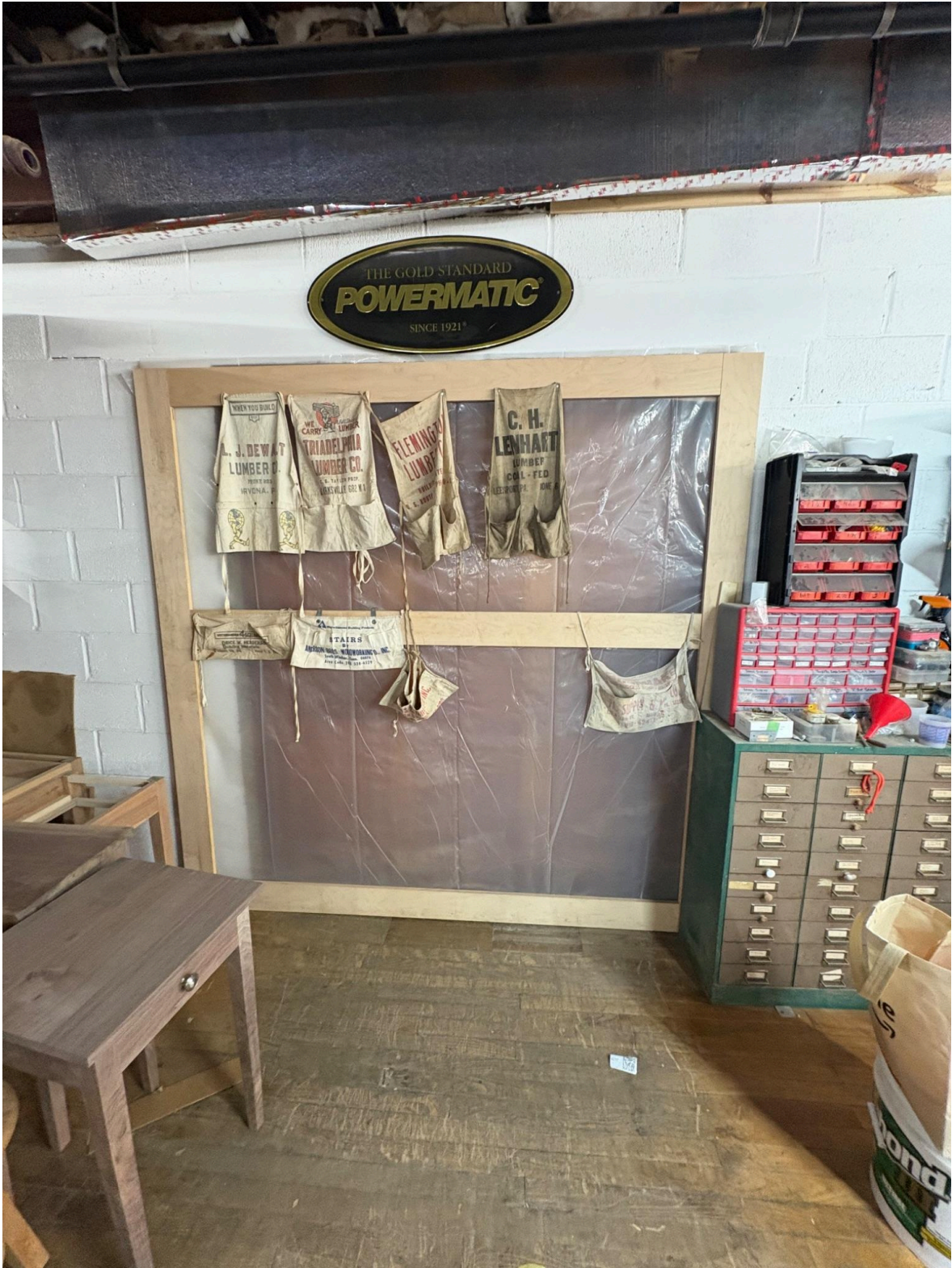
NJ Woodworks lumber yard nail pouch bibs "Classic"