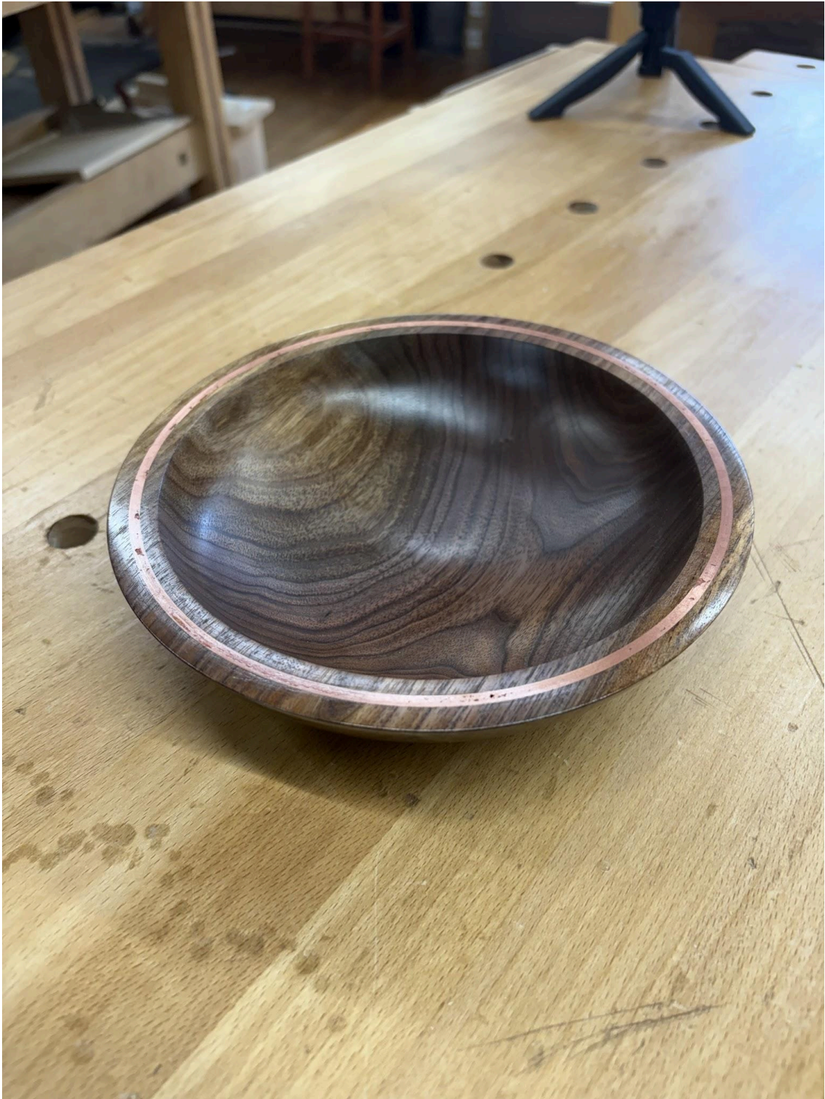
Ed - Copper inlay in walnut