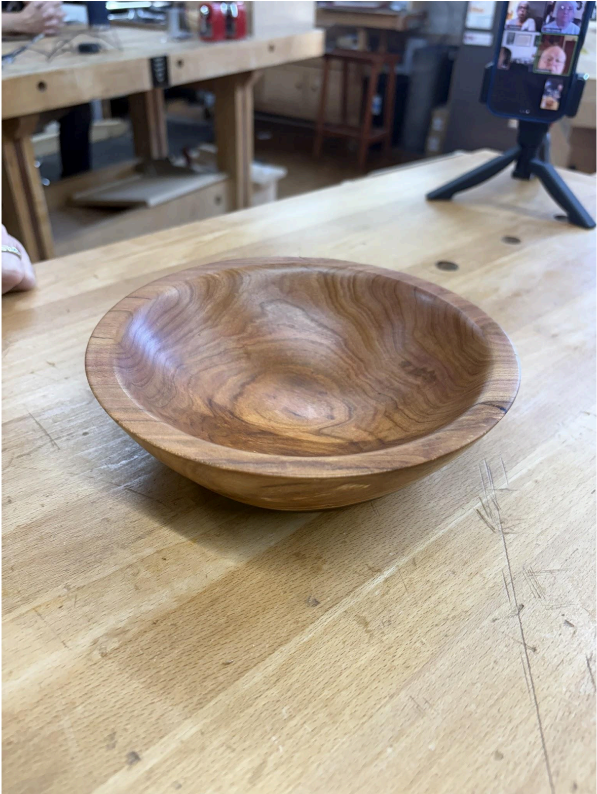
Ed - Plum