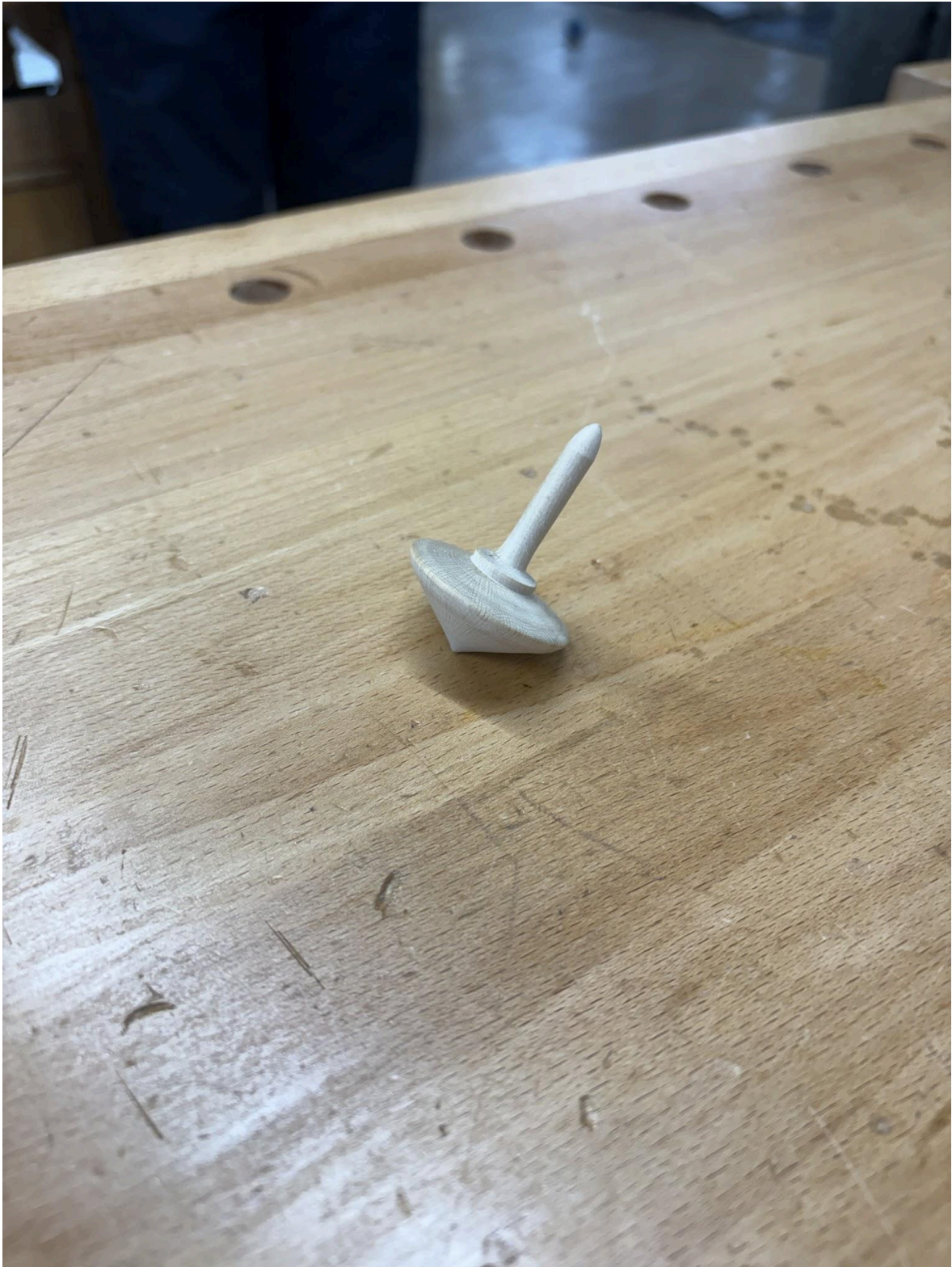
Dave - Spin Top, Ironwood