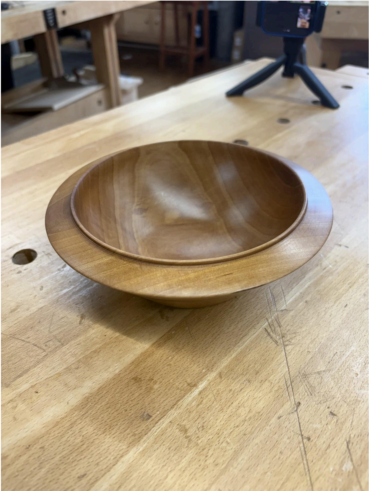
Ed - Cherry