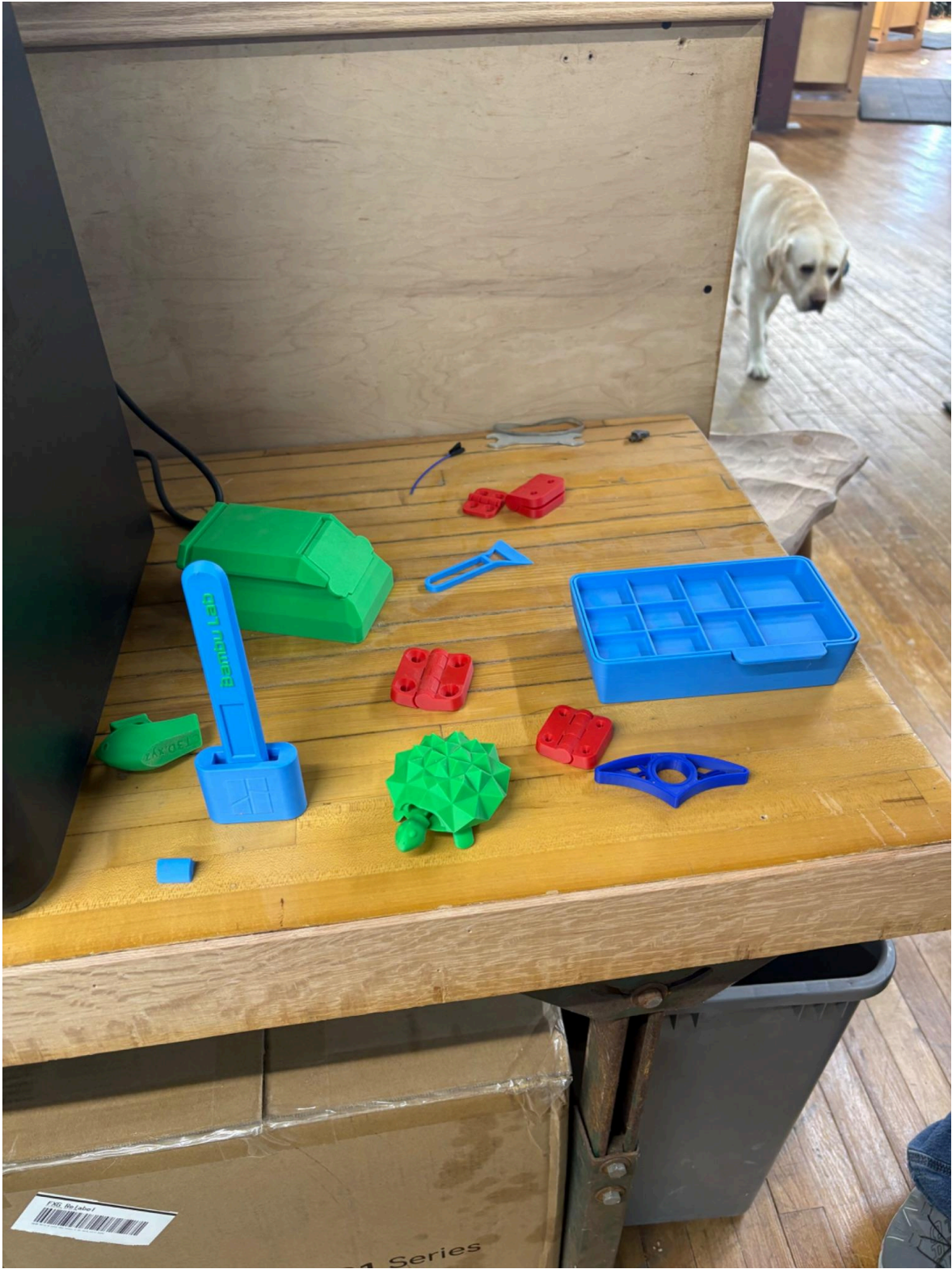
NJ Woodworks 3D printer items & Shop buddy!