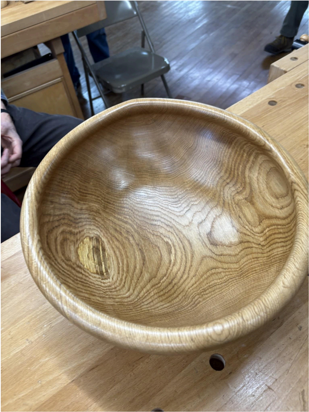
Larry's pith up!