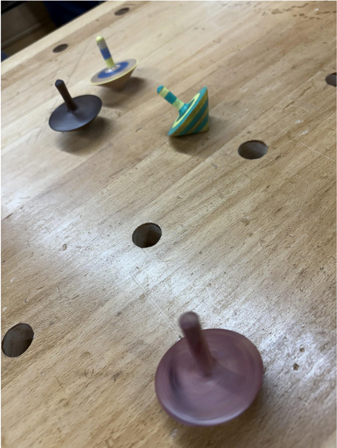
Keith - Assorted spin tops for PV