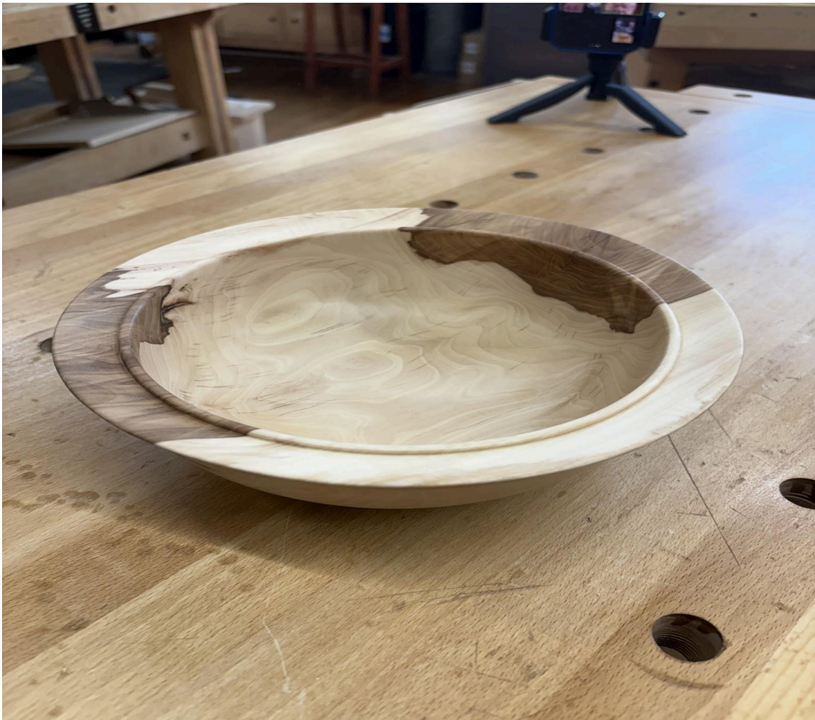
Cherry - Ed